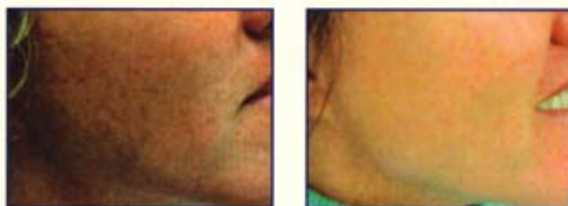
Figure 1. Type I Photorejuvenation. Photoaging and dyschromia, before (left), and after 3 IPL treatments using the 570nm filter, 40 J/cm 2 (right). Robert A. Weiss, MD, Hunt Valley, MD.

by the most common extrinsic and intrinsic cutaneous aging and photo damage changes, in order to specifically aid in the patient selection process and to guide discussion of present and future techniques.