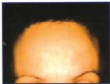
Figure 3. Type II Photorejuvenation. Wrinkles on forehead (left). Improvement seen 6 months after 4 IPL treatments (right). David J. Goldberg, MD, Westwood, NJ.